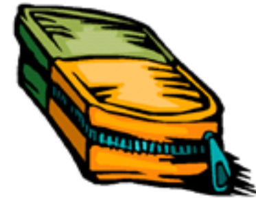
a pencil case