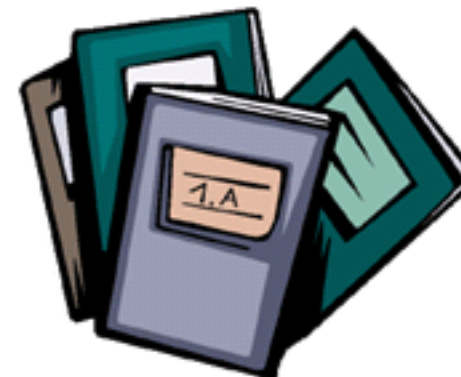
an exercise book