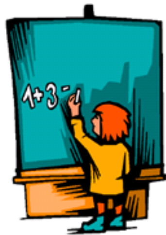
a black board