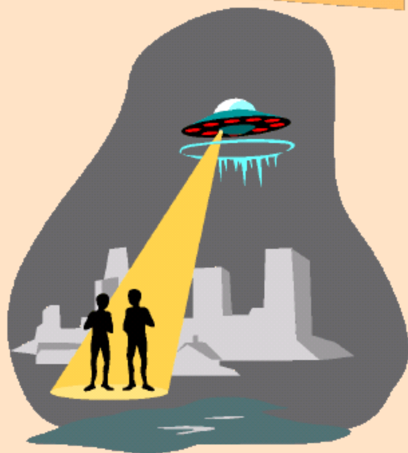
science fiction film