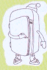
A FRIDGE /'frɪdʒ/