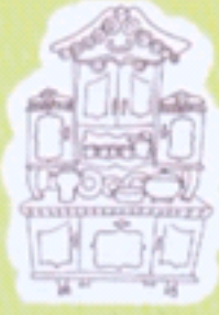
A CUPBOARD /'kʌbəd/