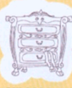
A CHEST OF DRAWERS /'tʃest əv drɔːz/