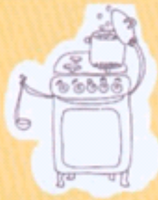
A COOKER /'kʊkə/