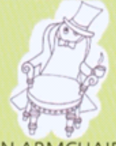
AN ARMCHAIR /'ɑːmtʃeə/