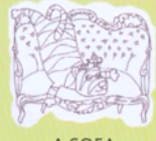
A SOFA /'səʊfə/