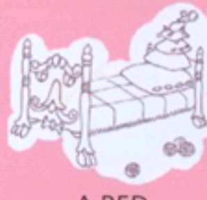
A BED /'bed/