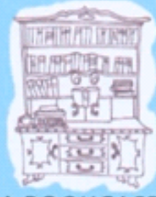
A BOOKCASE /'bʊkkeɪs/