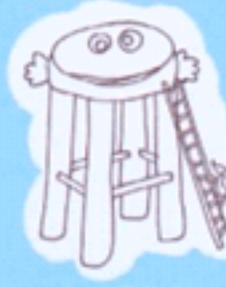
A STOOL /'stʊːl/