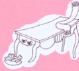
A COFFEE TABLE /'kɒfi 'teɪbl/