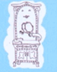
A MIRROR /'mɪrə/